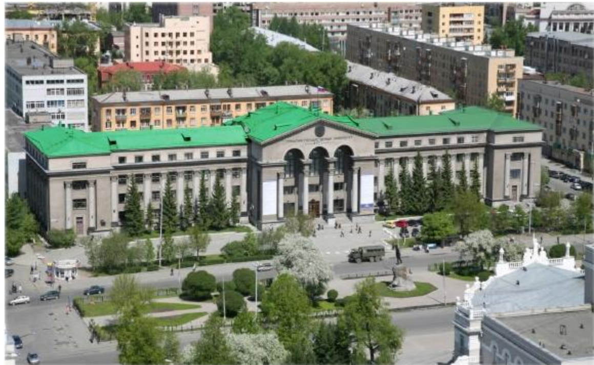
UrFU building in the central part of the city

To make a further step to a global scale, an interdisciplinary Master's Degree programme and a Summer School was implemented, under the name of Russian Studies in Real Russia .