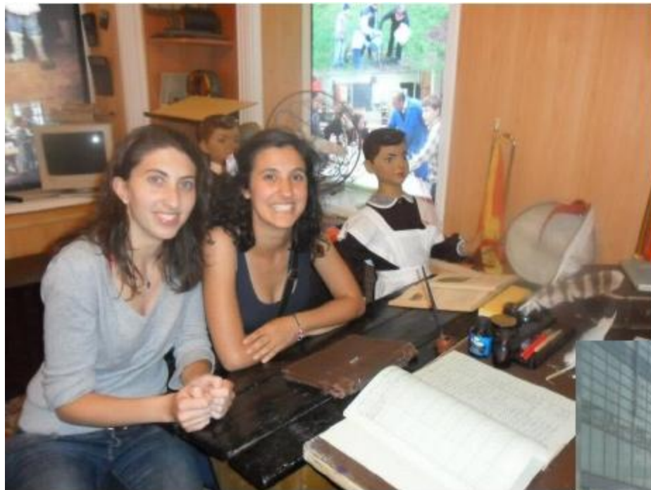
At the Museum of local history (2012)