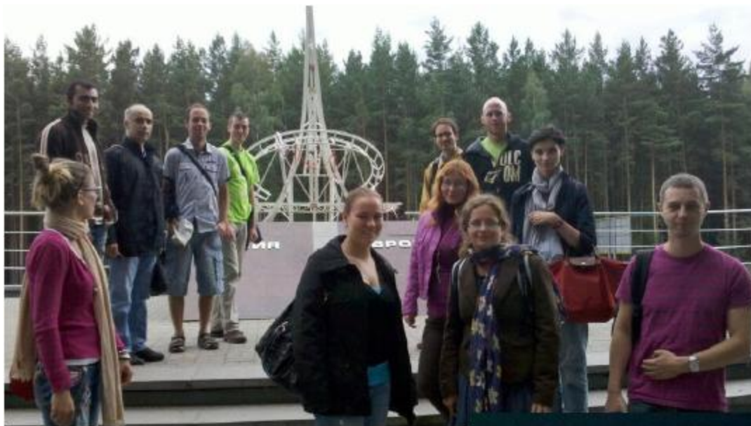
At the border of Europe and Asia (2011)