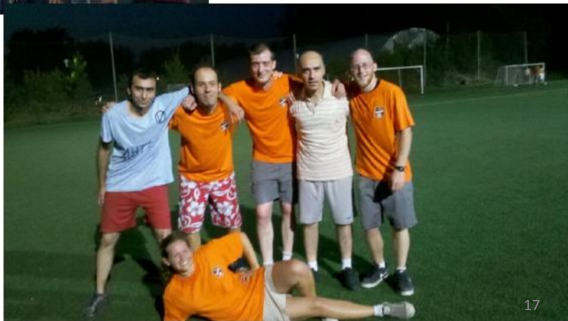
After the football match with locals (2011)