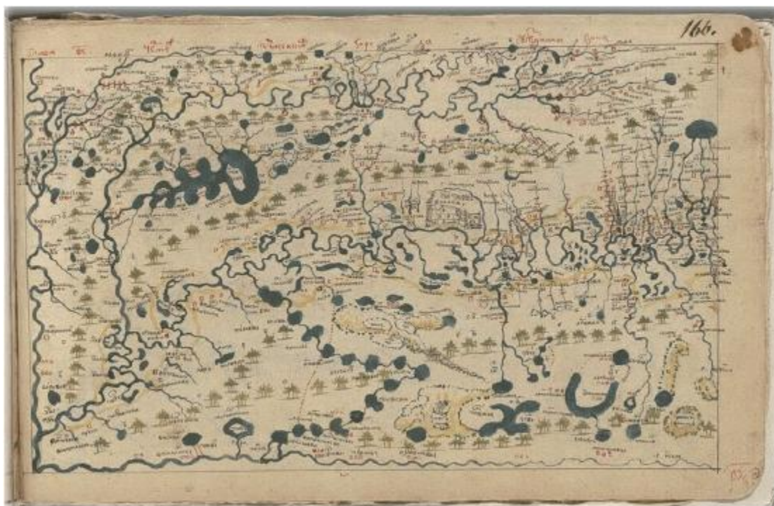
17 th century map of Urals, drawn by cartographer Semen Remezov

We are studying Russia as a part of Europe, while paying a special attention to the interaction of European cultural patterns with the unique factors, such as vast territory or multicultural and multiethnic environment.