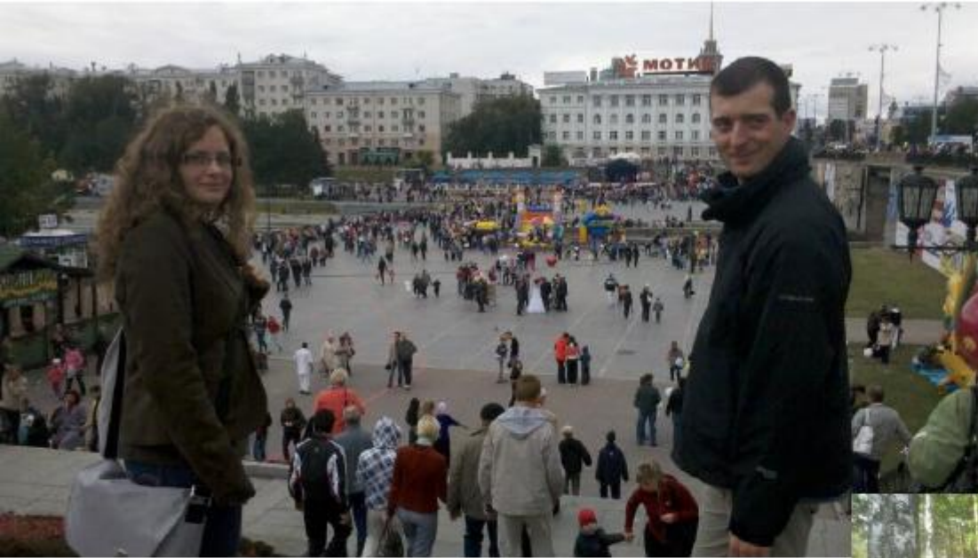
Day of the City (2011)

At the Ganina Yama – place where remains of the Nicolay Romanov were found,(2012)