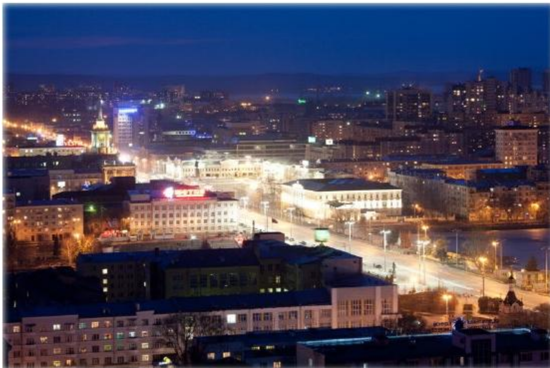
Central part of Ekaterinburg at night

Studying Russia in Ekaterinburg allows international student to get the understanding of 'Real Russia'. An old industrial region, a multicultural 'melting pot' on the border of Europe and Asia, Ural is providing an excellent practical addition to academic disciplines.