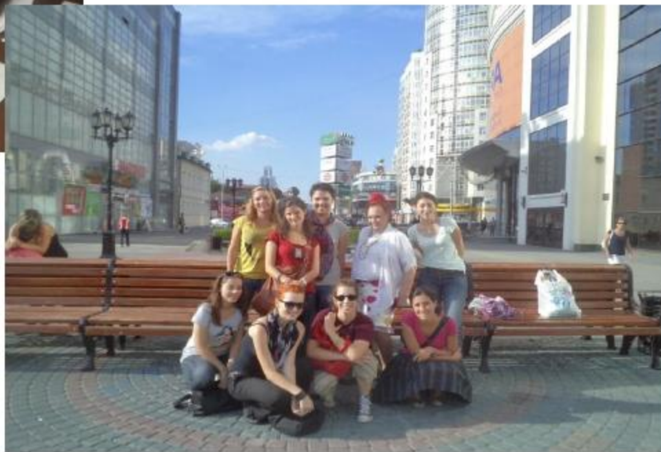
In the city (2012)